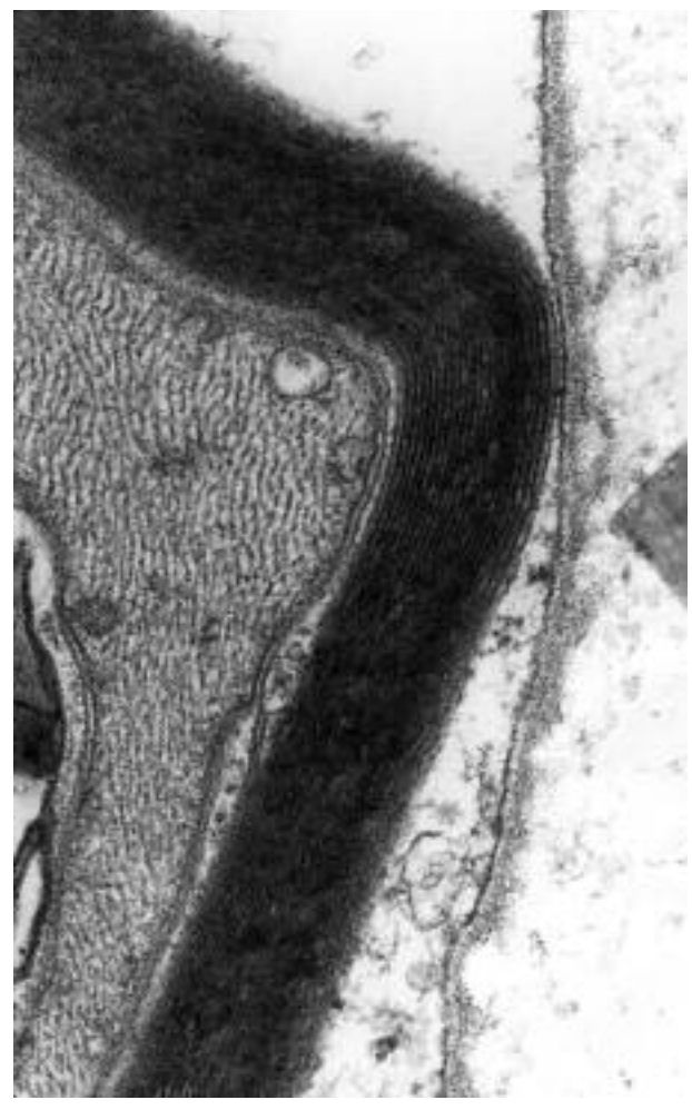
Fig. 3: Lamina over the surface of a Schwann cell: note how it follows the contour of the cell surface, in contrast to the fibronectin in figures 1 and 2.

Immuno-electronmicroscopy has confirmed the fibronectin content of the fibronectin fibril (8,10,13). The